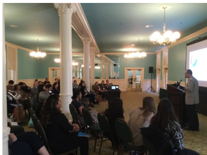
RIGHT: Members at the 2017 luncheon in San Antonio, TX.