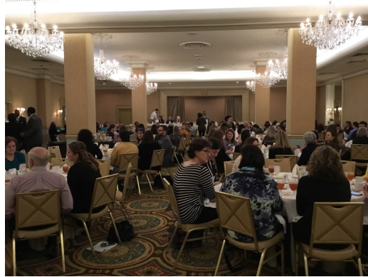
Top: 2018 SERA luncheon

For complete submission guidelines, please see the call for proposals . The SERA 2019 board is very excited about how the conference is shaping up. I look forward to meeting each of you for a very exciting time of learning and celebration in San Antonio!