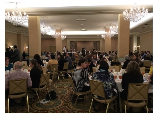
2018 SERA Conference Luncheon