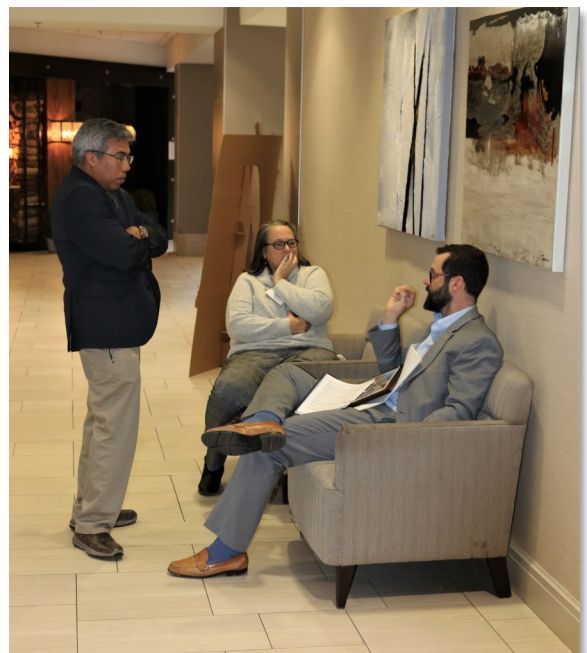
2020 SERA Conference Networking