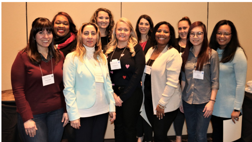
LEFT: Hotel Room Drawing Winners