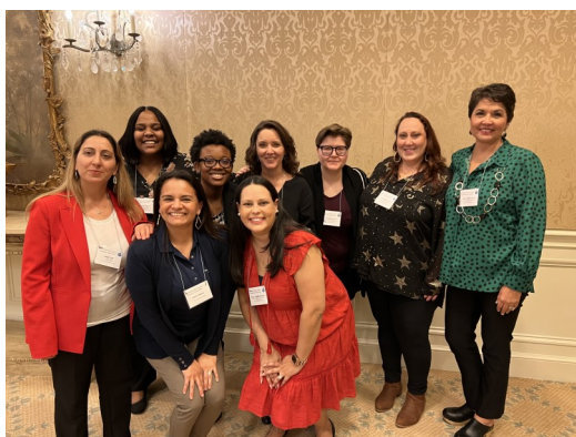
LEFT: 2022 Dean's Award Recipients