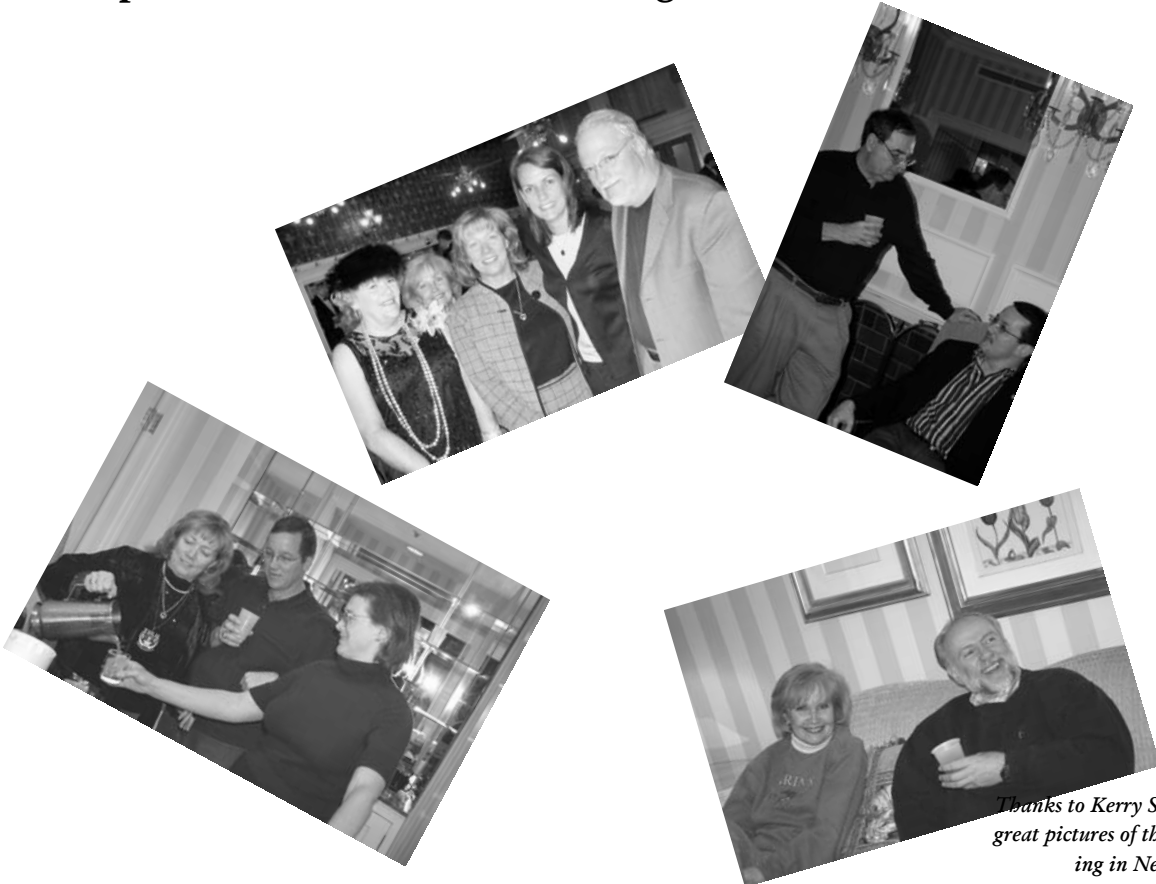
Thanks to Kerry Stamey for providing great pictures of the 2005 annual meeting in New Orleans.