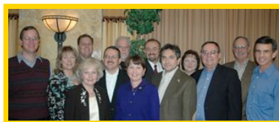
Former SERA Presidents