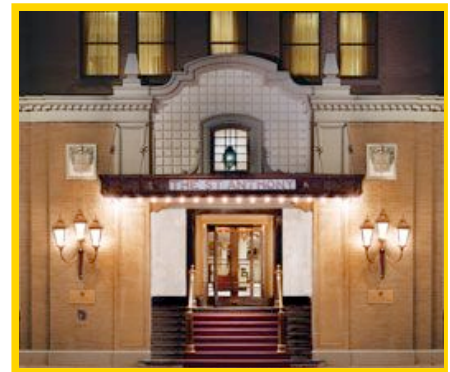
The St. Anthony Hotel, San Antonio Texas