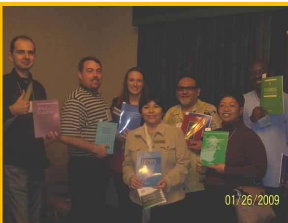
Routledge's Generous Donation