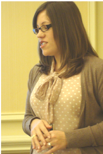
Ritter, Nicola Texas A&M University A Comparison of Distribution Free and Non- distribution Free Factor Analysis Methods