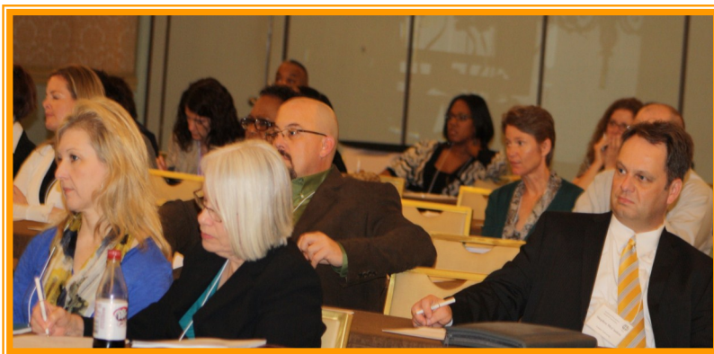
Audience at the 2012 Presidential Invited Address