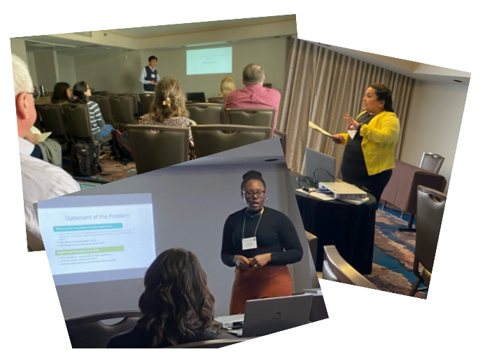
There were many excellent presentations by students and faculty !