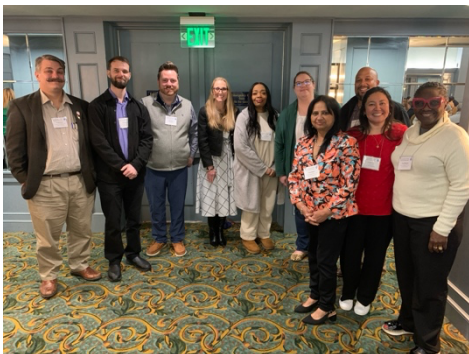
Congratulations to the winners of a free room night at the conference hotel!

1. When SERA contracts with the conference hotel for meeting room space and hotel room nights, SERA contracts that a certain number of hotel room nights will be booked by SERA members in exchange for free or reduced cost meeting room space. If the contracted number of room nights are not booked by SERA members, then SERA must nevertheless itself pay for those unused room nights. This can easily cost many thousands of