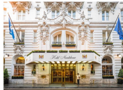
Hotel Monteleone in the New Orleans

The Hotel Monteleone is a favorite of those of us who have been SERA members for many years. Located in the French Quarter, the Hotel Monteleone is within walking distance from several great food, jazz, and drink options. It is a fantastic venue, and we look forward to your participation at the 2026 conference in New Orleans.