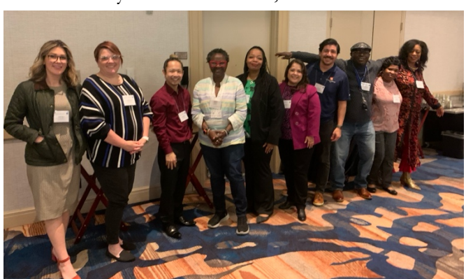
Congratulations to the winners of a free room night at the conference hotel!

the contracted number of room nights are not booked by SERA members, then SERA must